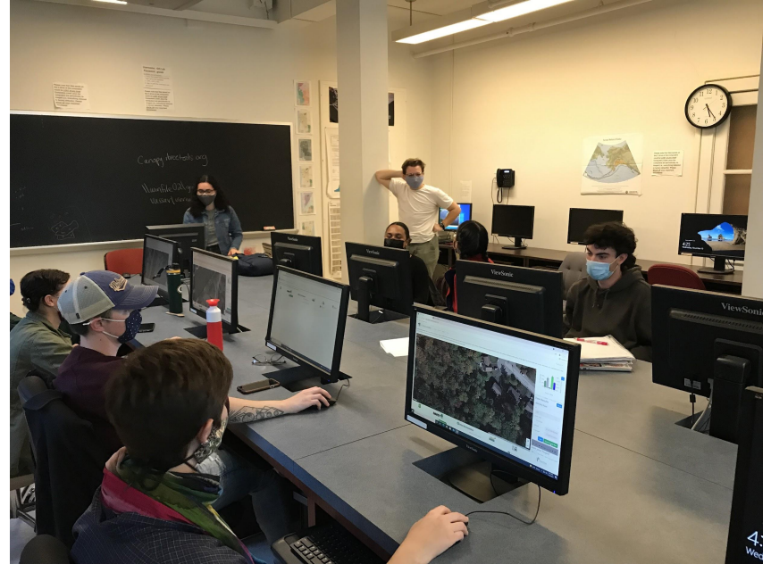
Students using i-Tree to collect data about tree canopy cover